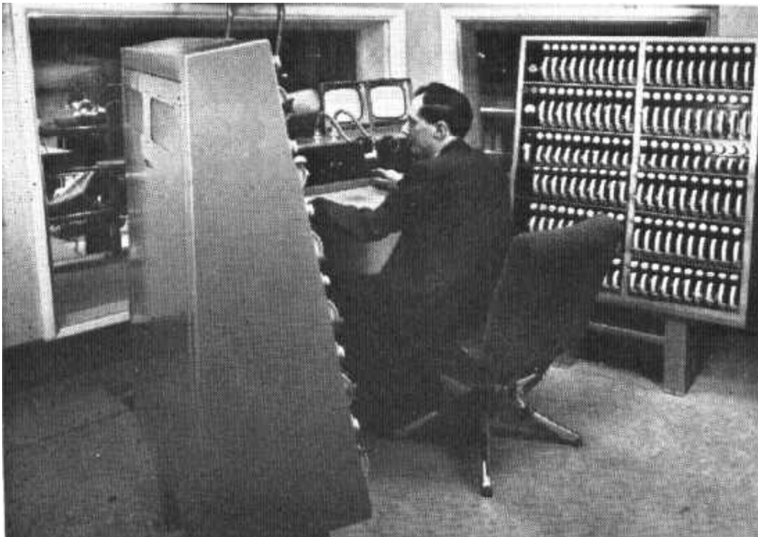
240 channel memory and preset control desk Strand System C. Four of these were in ATV Elstree Studios.