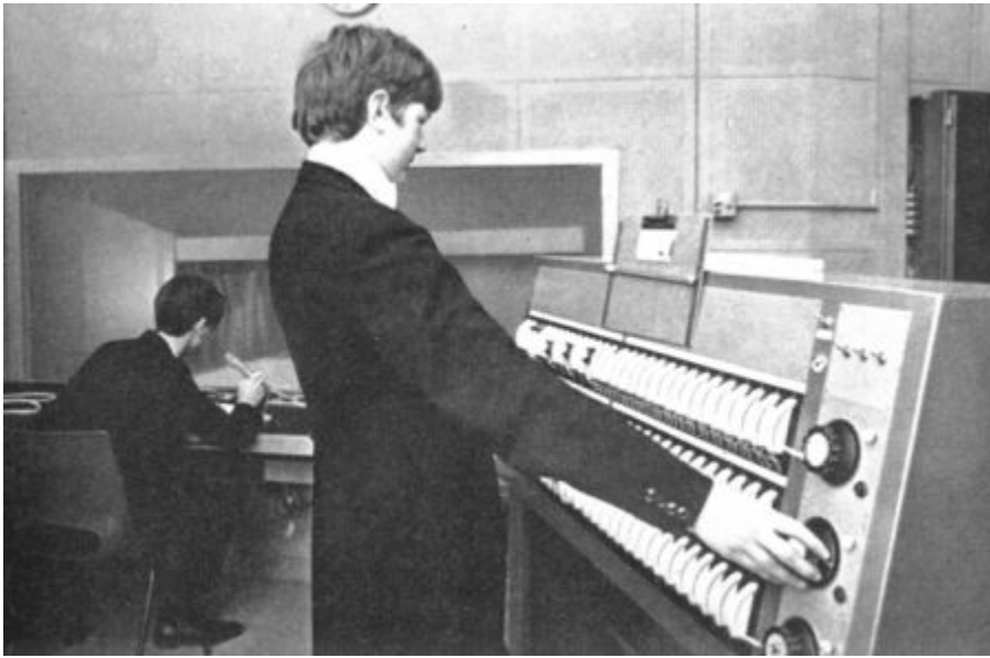
JP60 3-preset installed in the New Hall at Eton College, 1969