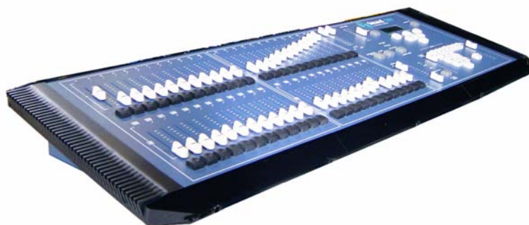
64320 200 Series 24/48 channel console