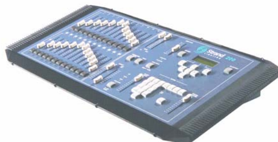
64312 200 Series 12/24 channel console