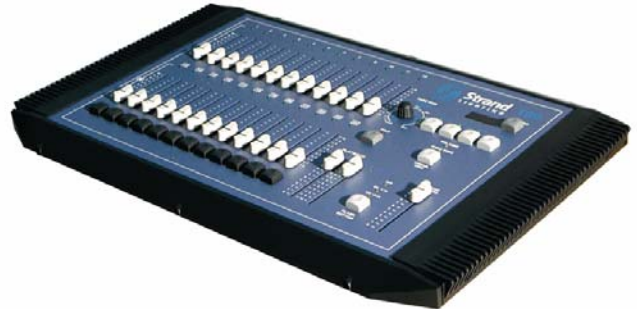
61312 100 Series 12/24 channel console