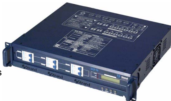
75400 SD6 Digital Dimmer Pack