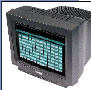
VGA DISPLAY AVAILABLE