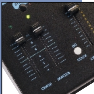
CUE STACK WITH POINT CUES